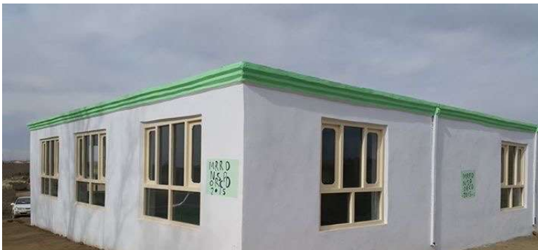
Community Center constructed by a CDC using BG funds of NSP and contribution of community

In 2015, ORCD continued facilitating the National Solidarity Program in Janikhel district of Paktika Province. Initially, ORCD was contracted by the Ministry of Rural Rehabilitation and Development (MRRD) for this project after a competitive bidding process to implement this project in Janikhail and Dila Districts and to assist communities to establish at least 75 Community