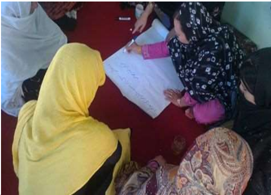
Women in Laghman during a group work of a training conducted by ORCD trainers