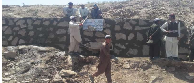
Volunteer laborers during construction of Protection Walls as part of AC activities