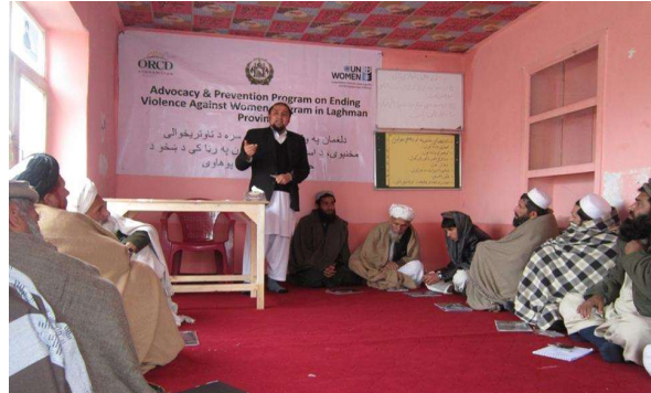
A training to community and religious elders on end of violence against women in Nangarhar province