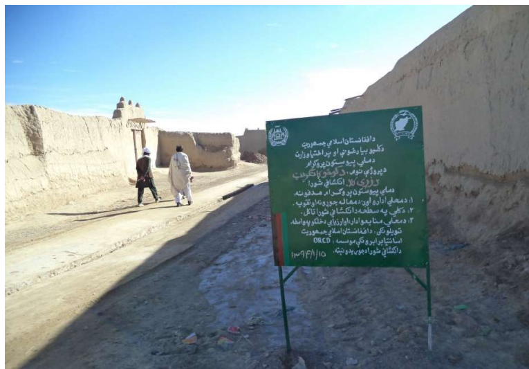
CDC Signboard in one of the villages of Janikhel district, Paktika

Aimed at rural community development, the overall objective of this project is to facilitate implementation of NSP in the remaining communities of Dila and Janikhel districts of Paktika Provinces for three years through 75 communities (25 in Dila, and 50 in Janikhel Districts).