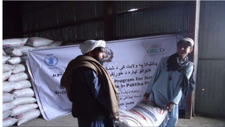
Displaced householder in Urgan; receiving food aid from ORCD provided by WFP

The Department of Refugees and Repatriation (DoRR) in Paktika Province expressed their highest satisfaction about the activities of ORCD in this province for the refugees and displaced population in Barmal, Urgan and other districts.