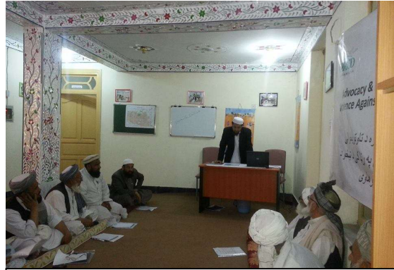
Training to community and religious elders on end of violence against women in Kunar province

The specific objectives of this project were: (1) To increase awareness of women/girls on human rights, improve and promote the civil, social, and cultural rights of women/girls; (2) To promote youth and men engagement and establish networking in support of Ending Violence Against Women (EVAW) law, the rights of women/girls and contribute in changing unequal gender norms and practices; (3) To increase access to justice systems and advocate for improved enforcement of laws protecting women against Gender-based Violence (GBV).