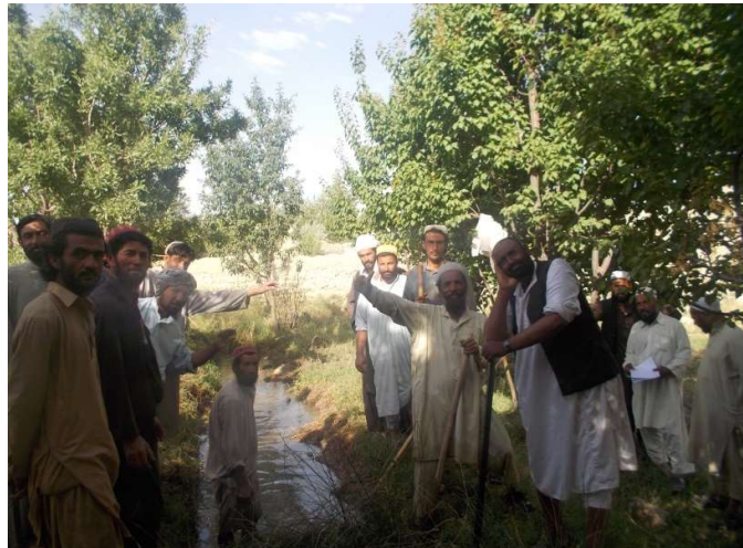
Volunteer laborers during cleansing canal as part of ESRP activities