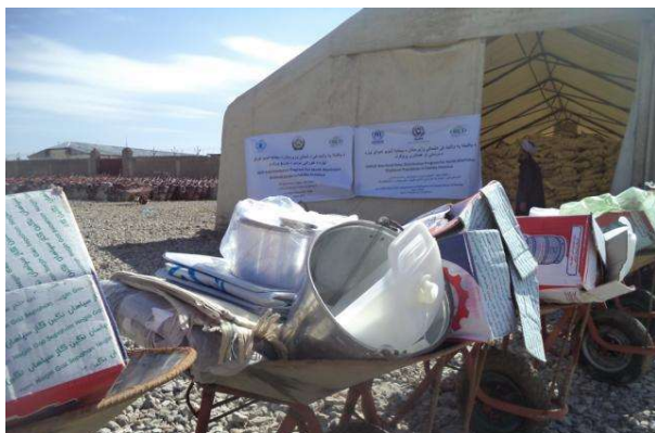
Distribution of Core Relief Items provided by UNHCR to the displaced population in Barmal district of Paktika

Faced with difficulties in transportation and a lack of relief coordination from the local authorities, thousands of families have opted to leave for bordering provinces in Afghanistan. In 2014, approximately 10,000 families were registered as refugees in Paktika province.