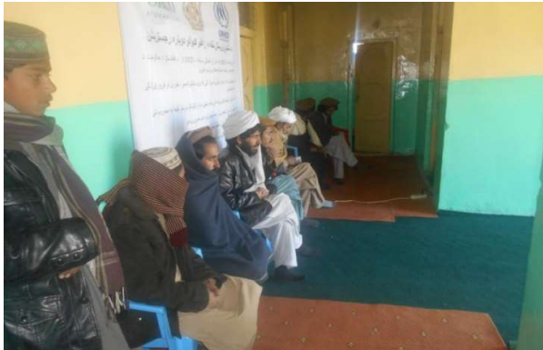
Heads of the displaced population along with their family members in the waiting hall of Re-verification Site in Barmal

Additionally, ORCD was given the responsibility of re-verification and expanded level-1 registration of these displaced population by UNHCR in December, 2015. This exercise was aimed at verification of the existing caseload of the displaced population of North Waziristan in Urgan and Barmal districts of Paktika province. Furthermore, re-confirming the nationality of the previously registered refugees, determining the number of those families who currently remain in Afghanistan and identification of Persons with Specific Needs (PSNs) were the main objectives of this exercise. In December, 2015 alone, number of 1,493 households of these refugees was re-verified in Barmal district only.