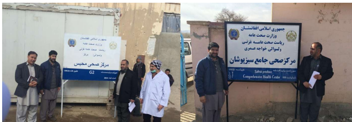
ORCD and GCMU's Senior Staff during a Supervision Mission visiting Health Facilities in Ghazni

The primary target populations of this project are pregnant women and children under five years of age. Though, the entire population in the target areas is able to receive basic health services through Health Posts, SHCs, Prison Health Center, BHCs, CHCs and CHC+.