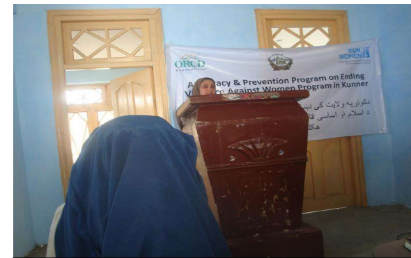
Kunar Director of Women Affairs delivering speech during a gathering in Kunar province