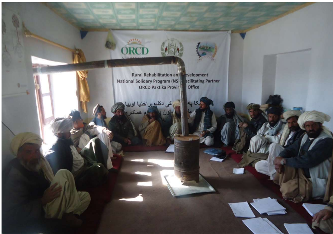
Community Development Councils (CDCs) discussing development issues of their villages with field staff of ORCD during Project Cycle Management training in the Janikhel District Office