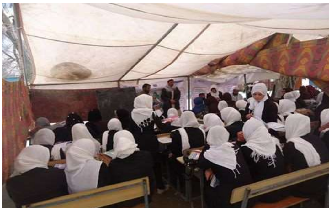
Stop TB Awareness Campaign in a Girl's School in Ghazni province