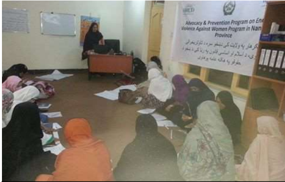
A session of women trained on their rights in Nangarhar Province