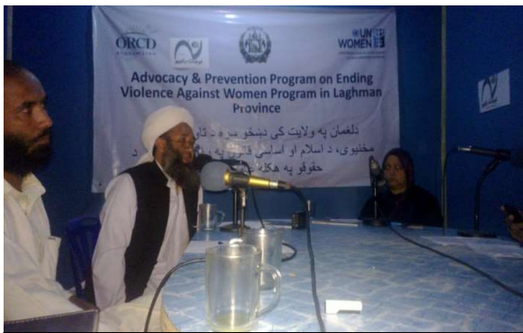
During a round table discussion from a local radio in Laghman Province