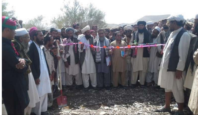
District Governor & community elders in Sarawza district are cutting ribbon for inaugurating AC project

Funded by the United Nations World Food Program (WFP), the objective of this project was to alleviate food insecurity in Paktika province as well as to improve the resilience of target communities toward drought and floods in this province. The project was also aimed at provision of food items to the refugees from North Waziristan who fled their homeland and settled in Barmal district of Paktika province.