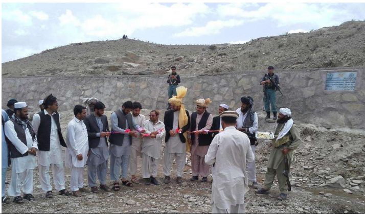
Directors of Rural Rehabilitation and Development and Provincial Development Council of Paktika; cutting ribbon in the AC Project Completion Ceremony in Augdar (Tawda China) village of Sharana, Paktika

The Department of Refugees and Repatriation (DoRR) in Paktika Province expressed their highest satisfaction about the activities of ORCD in this province for the refugees and displaced population in Barmal, Urgan and other districts.