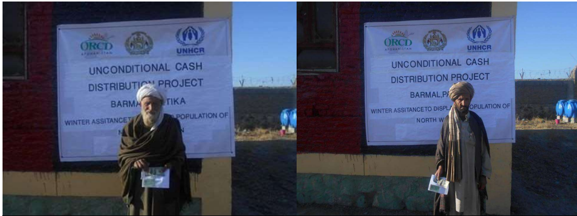
Heads of the displaced households after receiving Unconditional Cash in Barmal district of Paktika

It is assumed that the project will continue during the year 2016 because there is no hope insight that these refugees would return to their homeland soon.